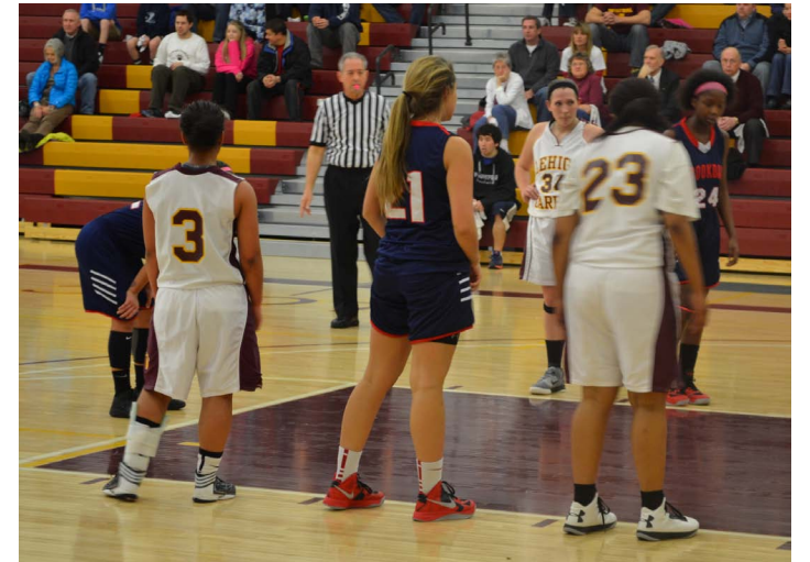
More pictures are at www.flickr.com/photos/lehighcarboncc .

LCCC students worked with WXLVradio.com to